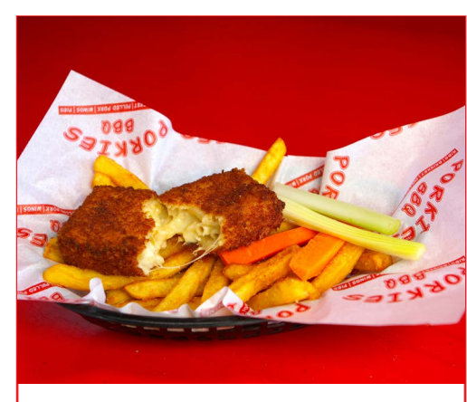
MAC N CHEESE