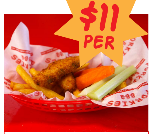
HOMEMADE CHICKEN NUGGETS (2) PIECES