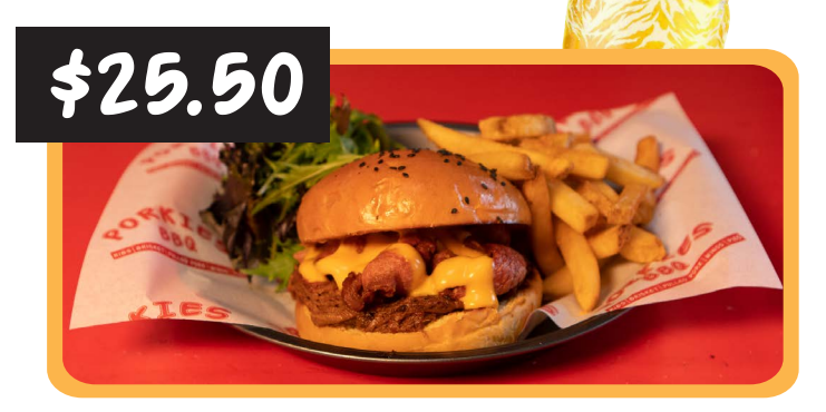
SMOKED BRISKET BACON CHEESE S/W FRIES, GREENS & COKE