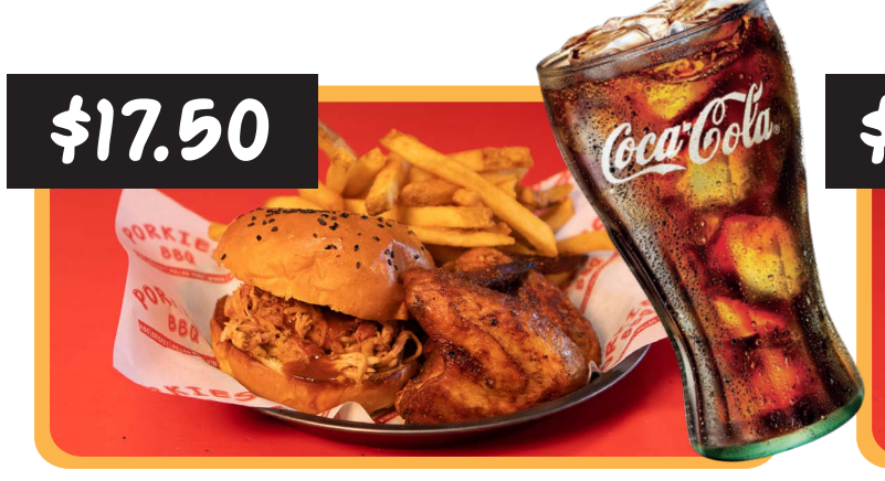
PULLED PORK S/W FRIES, WINGS & COKE