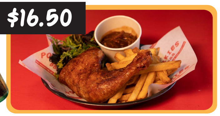
SMOKED CHICKEN MARYLAND