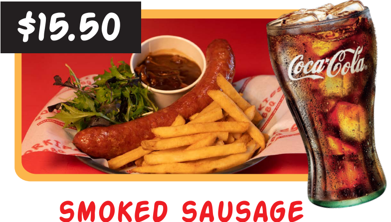
FRIES, GRAVY, GREENS & COKE