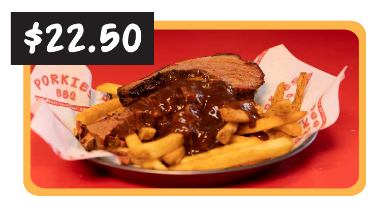
SMOKED BRISKET (1506) FRIES, GRAVY & COKE