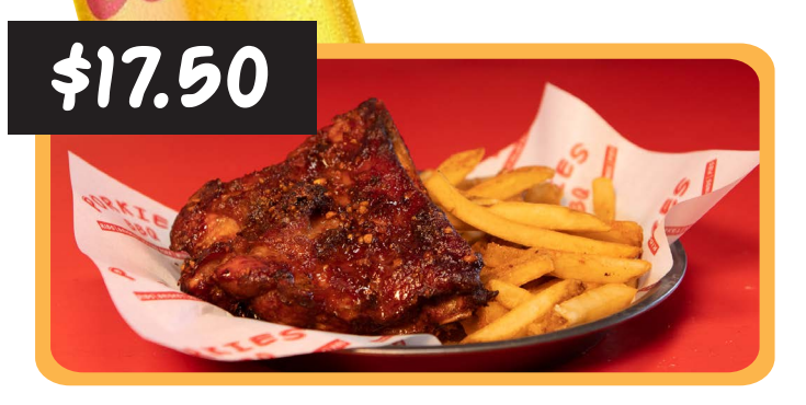
RIBS, FRIES & COKE